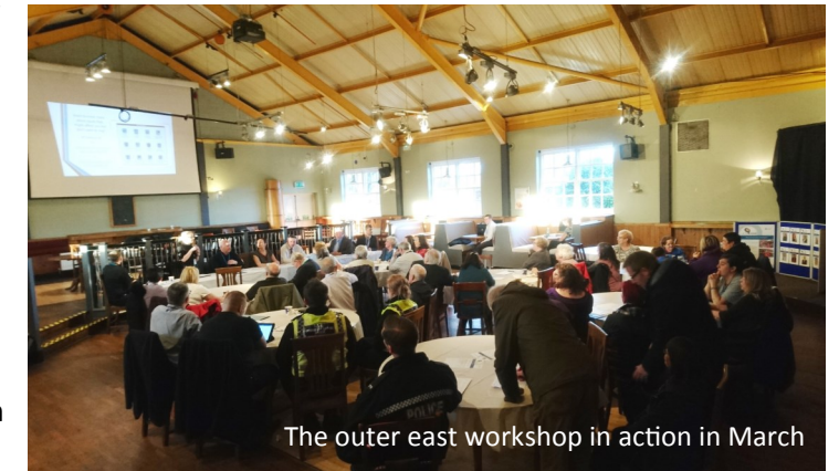
The outer east workshop in action in March

If you'd like adding to the mailing list please contact us on 0113 378 5808 or email southeast.ast@leeds.gov.uk