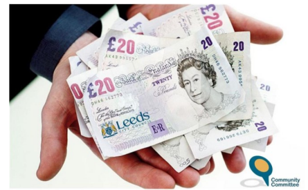
The Outer East Community Committee has a small grant budget for community / voluntary groups in your neighbourhood - just ask! 0113 378 5808 / Facebook: LccOuterEast