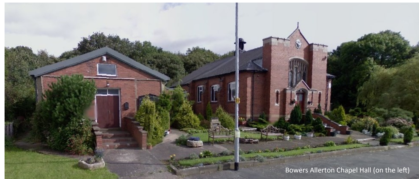
Bowers Allerton Chapel Hall (on the left)

Community Committee business meeting where members of the public are welcome to observe proceedings and if you wish to speak on a community matter, you have the option within the 10 minute open floor section but please let us know in advance of the meeting what you wish to raise with the Committee by giving us a call on 0113 378 5808 or emailing southeast.ast@leeds.gov.uk as we will also try to get an appropriate spokesperson to attend.